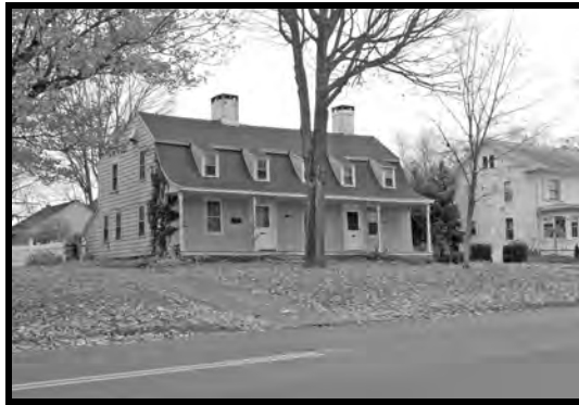
Sanford-Bristol House, c. 1790, saved 2013 by the Milford Preservation Trust and the Connecticut Trust for Historic Preservation

Many of the historic structures lost over the past century might still be standing if buyers, sellers, neighbors, and government leaders had better understood their importance and the alternatives to their demolition. A goal of the Milford Preservation Trust is education about historic preservation and the available help from national and state agencies and preservation groups.