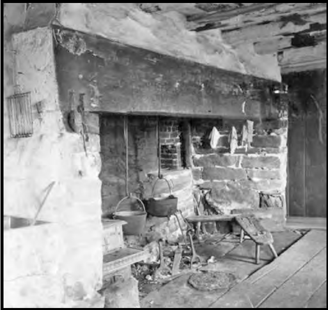
Hearth of the Clark Tavern, where George Washington paid a visit. Demolished 1949.

First and foremost among the goals of the Milford Preservation Trust is the protection of the historic structures in the city of Milford. We also support state and local agencies and groups that work to protect and preserve historic sites and structures.