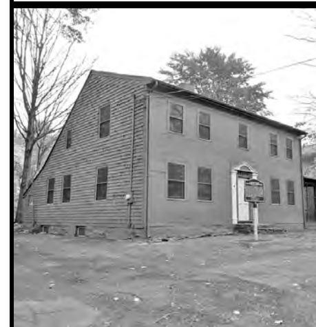
John Downs House c.1790